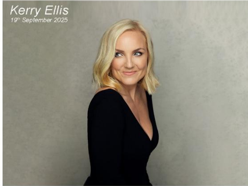
Kerry Ellis - Queen of the West End Live on stage 19 th September