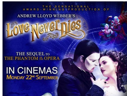
Love Never Dies Screening on 22 nd September