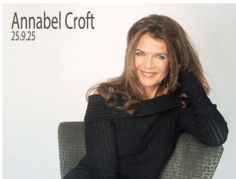
Annabel Croft - From Tennis Ball to Glitter Balls Live on stage - new intimate show