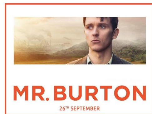
Movies @ the Hall 7:30pm - tickets £5