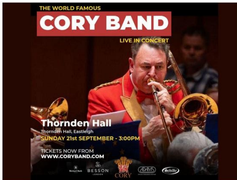
Cory Band in Concert Sunday 21 st September