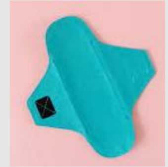
Re-usable sanitary pad

Comfortable, eco-friendly, can be worn with other products for extra protection against leaks.